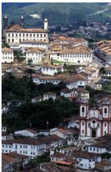
Ouro Preto, Minas Gerais, Brazil