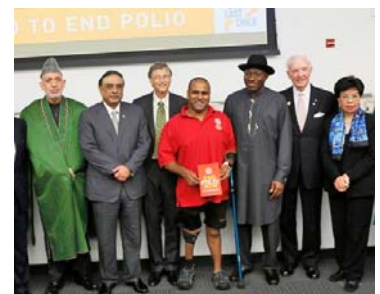
Polio Leaders Summit