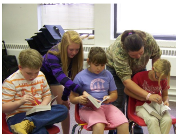
Interact students help third- and fourth-graders at Cody-Kilgore Elementary School look up words in their new dictionaries.

Nearly 50 people learned from the Foundation Seminar presentations about PolioPlus, Future Visions, and International Projects that meet the Future Vision requirements.