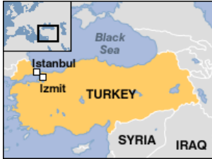
Izmit, Turkey was at the center of massive earthquakes in 1999.