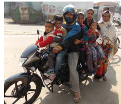
Top: Connie Francis administers polio vaccine to a young boy. Middle: Vaccine dropper bottles next to a volunteer's cap. Bottom: A whole family arrives at the immunization clinic...on one motorcycle.