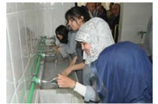
Top: Rotary club in Lebanon with water tank. Above: Lebanese children at water taps.