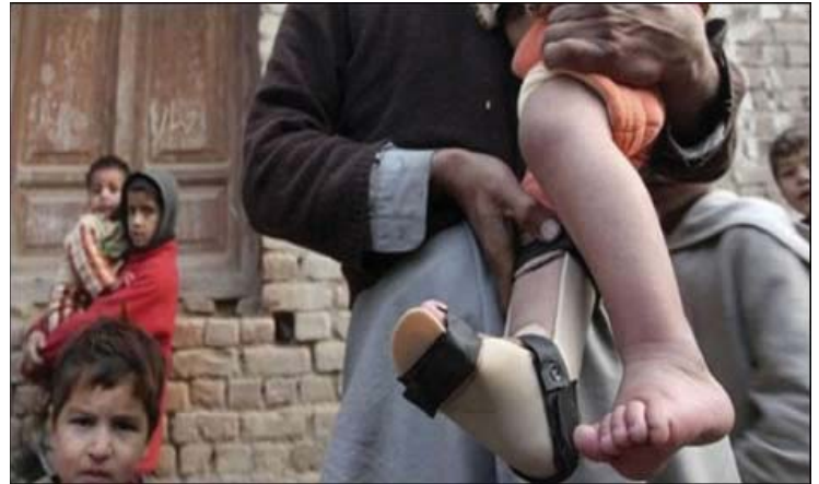
Above: A fresh polio case in Khyber Pakhtunkhwa. Below: A polio worker travels with a police officer on his motorbike in Karachi.

Rotary depends on our members to do our fair share in helping to meet the $75 million of additional funding that was committed in September to support the polio eradication effort. Thanks for all you do for Rotary!