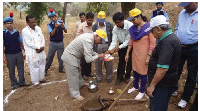
Top: A typical check dam. Below: This photo of the groundbreaking ceremony illustrates some of the cultural differences between the U.S. and India. A Rotary Club member spreads flower petals as an offering for success of the project. In India, prayer at public events is normal and religion and other areas of life are not separate. Busses and taxis commonly have religious pictures displayed inside. Work sites typically have altars and prayer sites and small chapels sit prominently on the grounds of factories.