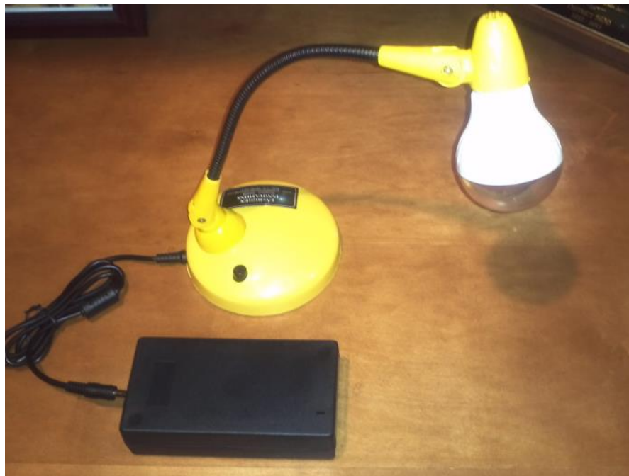
Solar lamps like this one will be given to students in India as parts of the Light for Education project.