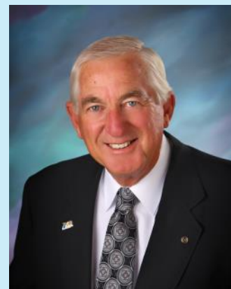
District Governor Duane Tappe