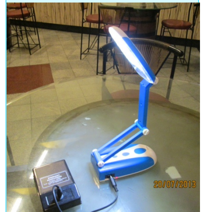
This is a rechargeable solar lamp. The District Foundation is working on a project to provide thousands of these lamps to students in India.