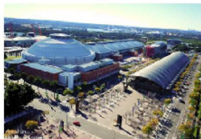
The House of Friendship & the Train Station