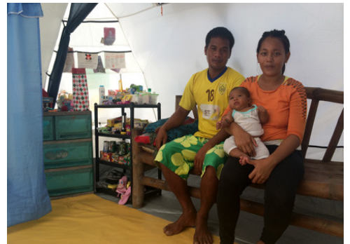
Hazel considers the Shelterbox tent her baby's first home.

the deployment can be viewed here http://www.flickr.com/photos/shelterboxuk/sets/72157637551983974/ .