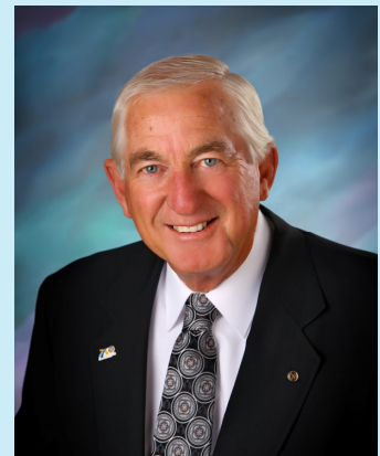
District Governor Duane Tappe