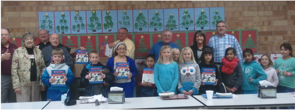
Imperial Rotary gives dictionaries to third-graders in December.