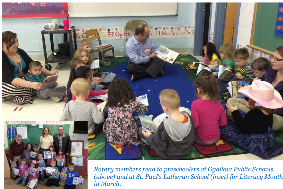
Rotary members read to preschoolers at Ogallala Public Schools, (above) and at St. Paul's Lutheran School (inset) for Literacy Month in March.

This was a new service project for Ogallala this year. The teachers said they appreciated having volunteers to help increase early learning and promote good literacy skills.