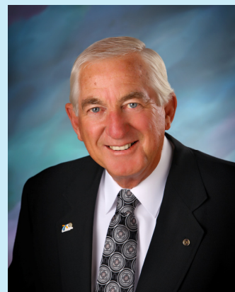
District Governor Duane Tappe