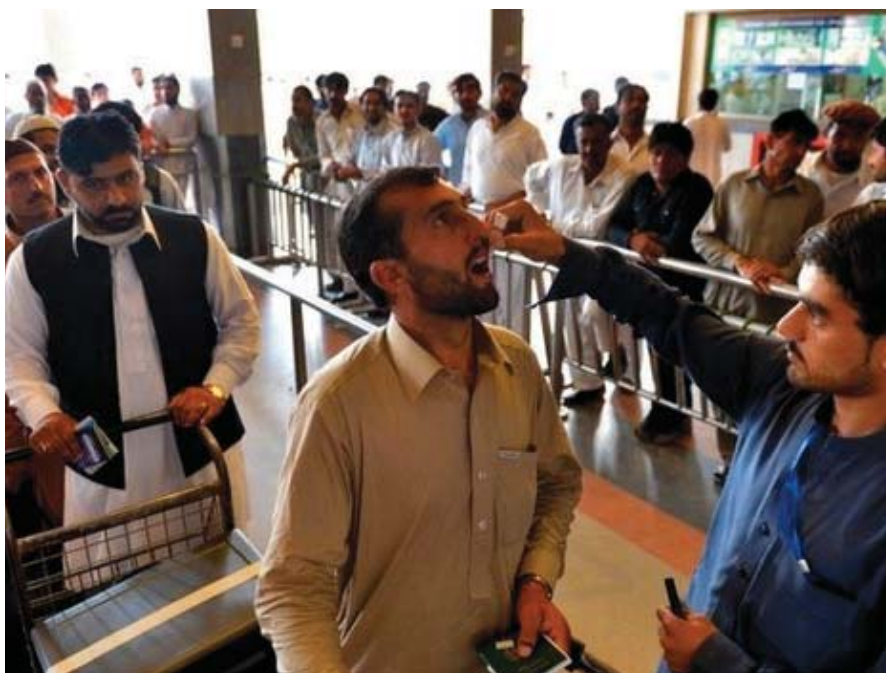
Beginning June 1, Pakistanis need a dose of polio vaccine to leave the country.