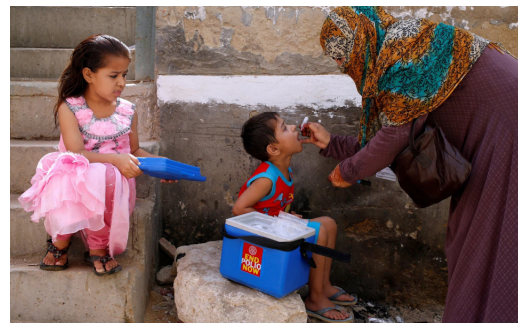
A boy in Karachi, Pakistan, receives a polio vaccine

AFGHANISTAN – 14 total polio cases in 2017. There have been eight cases so far this year (compared to only three cases by this date in 2017). Radio broadcasts and "mobile mullahs" are being used to educate the local populations about the importance of vaccination for the protection of their children. In May, 9.6 million children received bivalent polio vaccine during the most recent national campaign. Of these, 1.5 million children on-the-move were vaccinated at 386 different transit points.