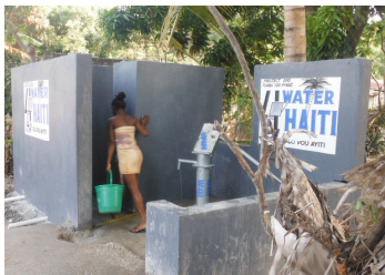
Bathhouse for privacy

Water4Haiti celebrates its 10th anniversary this year. During this time they have installed 25 two-inch irrigation pumps, toilets, and bath houses. They've cleaned old wells and installed hundreds of new pumps.