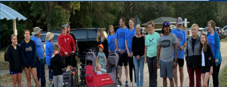
Arnold Rotary provided breakfast for 200 volunteers who helped with the 2024 Sandhills Open Road Challenge, a 55-mile rally style open road race through the scenic Nebraska Sandhills.